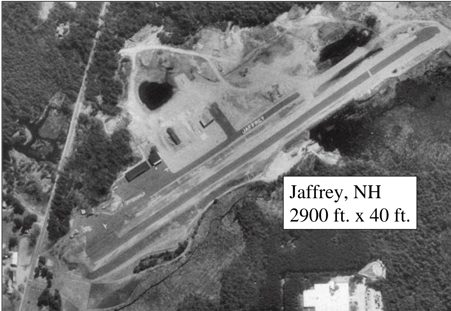
Jaffrey, NH 2900 ft. x 40 ft.