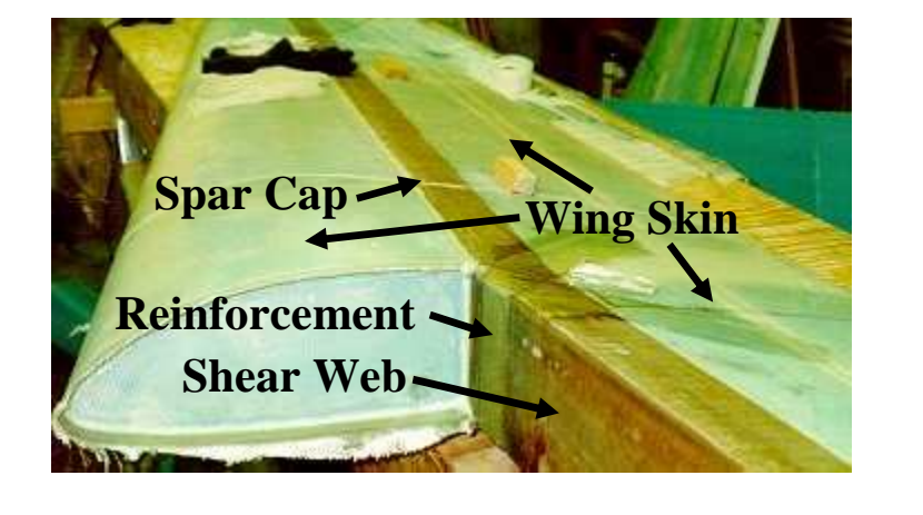
23 July 2011

Stiffen fuselage in bending (sideways) and twisting