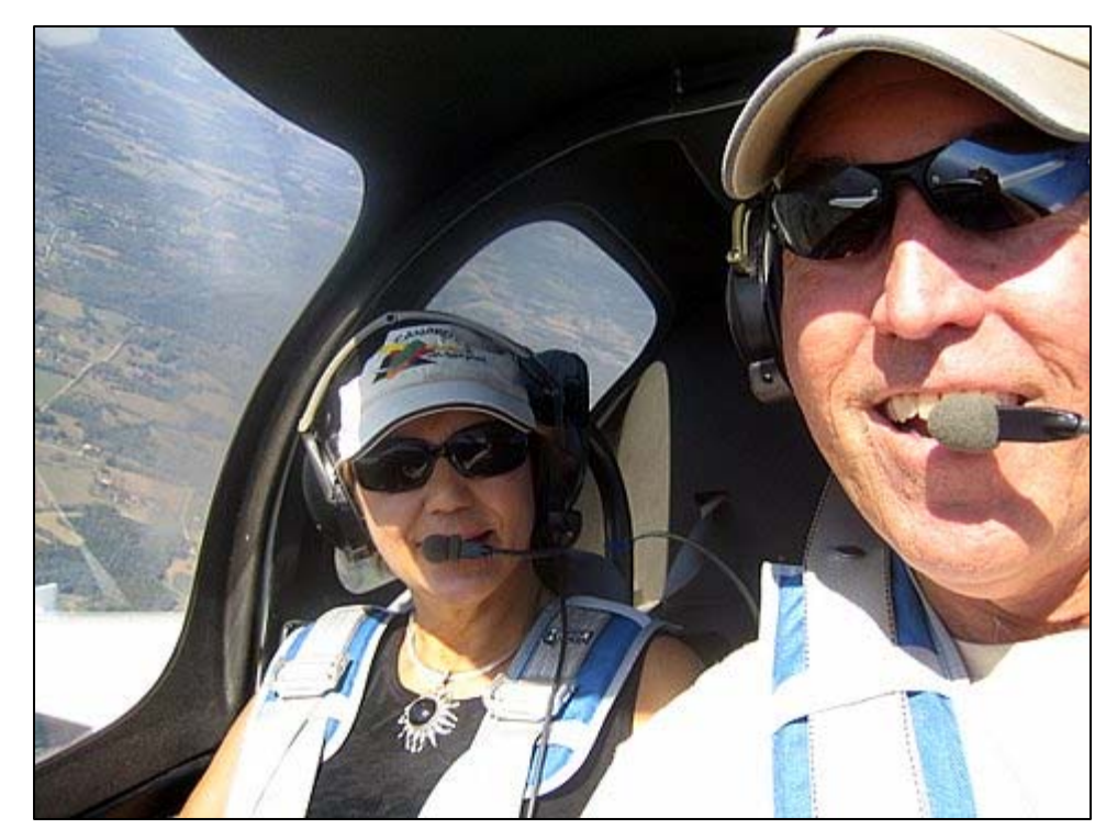
After 6500 man hours of work and 14 years the first flight occurred in the spring of 2003